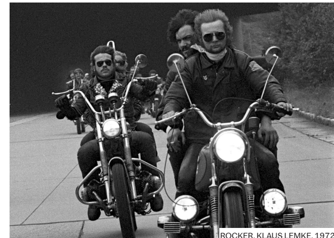
ROCKER, KLAUS LEMKE, 1972

Dir. Randa Chahal Sabbag, 1979. Lebanon/France. 80 min 2/7 7:30pm • 2/11 5pm • 2/24 5pm 2/26 7:30pm Two short films providing a micro and macro view on neighboring Lebanon and Palestine's history of solidarity and discord, both motivated by the Arab nationalist movement. The first details the lives of children orphaned in the 1976 seige of the Tel al-Zatar refugee camp, while the second employs archival images, broadcasts, interviews, and raw documentary footage to chronicle the relationship between the two states in the lead up to the Lebanese Civil War.