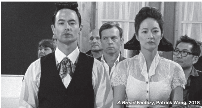
A Bread Factory , Patrick Wang, 2018