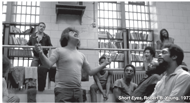
Short Eyes , Robert B. Young, 1977

Dir. Jacques Tourneur, 1957. USA. 79m 9/3 10 pm • 9/15 7:30 pm • 9/24 10 pm Released nine years after Tourneur's masterpiece, OUT OF THE PAST, and photographed by film noir legend Burnett Guffey, Nightfall tells the story of an artist (Aldo Ray) who desperately tries to prove his innocence for a murder and robbery he didn't commit.