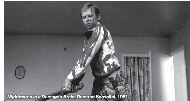
Nightmares in a Damaged Brain, Romano Scavolini, 1981

Dir. Timothy O'Rawe, 1989 USA. 79 min 10/12 Midnight • 10/18 Midnight A shot-on-video camp-fest anthology structured as a series of 'flash-forwards', each segment follows one of our confused basement dwellers as they do something 'unforgivable' and are then swiftly punished for it.