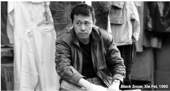
Black Snow, Xie Fei, 1990