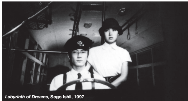
Labyrinth of Dreams, Sogo Ishii, 1997