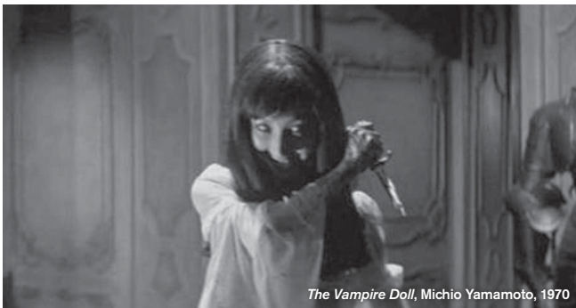
The Vampire Doll , Michio Yamamoto, 1970