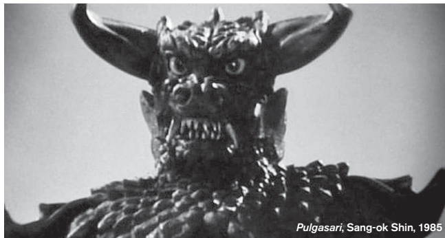
Pulgasari , Sang-ok Shin, 1985