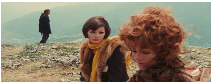
Your Vice Is a Locked Room and Only I Have the Key, Sergio Martino, 1972