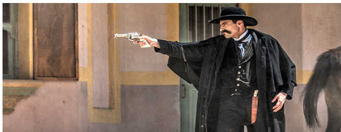
Tombstone Rashomon, Alex Cox, 2017

Please visit spectacletheater.com for a full listing of films and events.