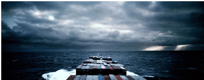
The Forgotten Space, Allan Sekula and Noel Burch, 2010

Please visit spectacletheater.com for a full listing of films and events