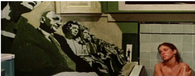
Messiah of Evil, Willard Huyck and Gloria Katz, 1973